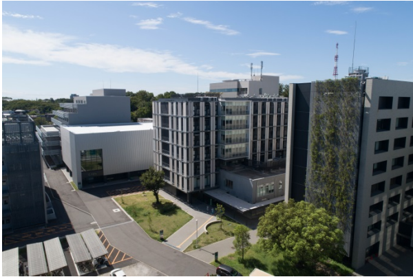
Institute of Materials and Systems for Sustainability